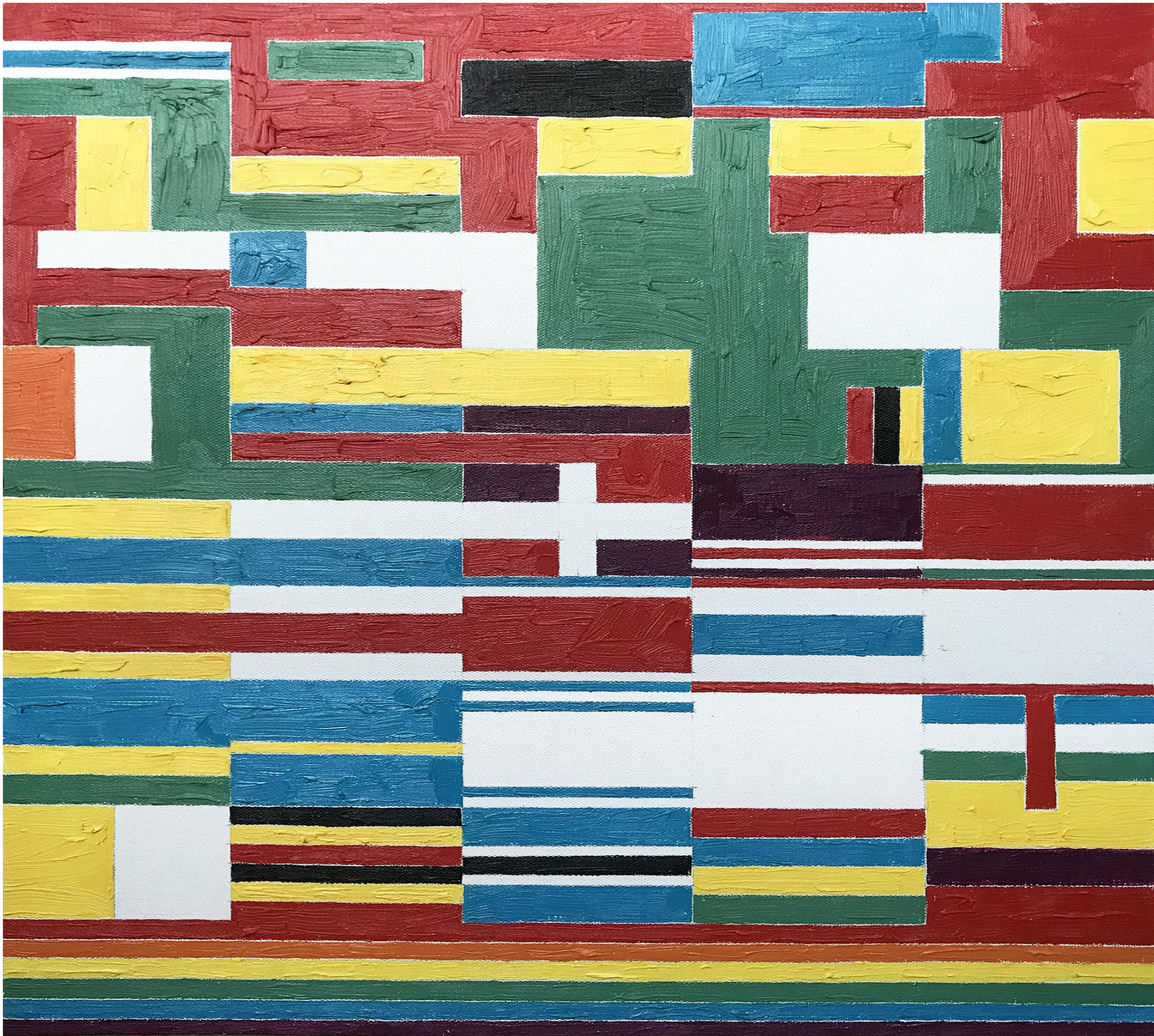
Farhad Nikfam Rainbow flag, 2019 Oil on canvas, 63x70 cm Price: 7000 USD