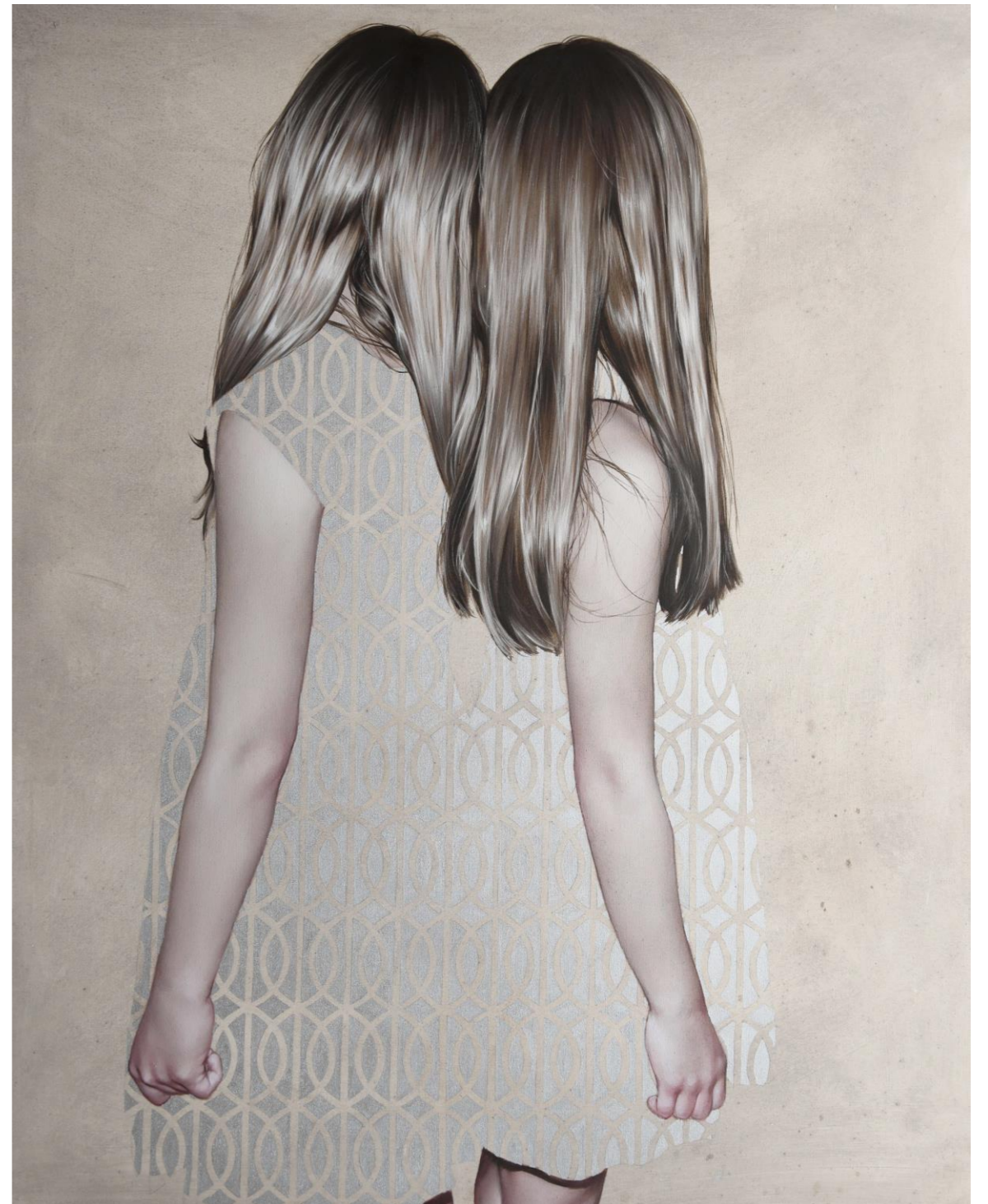
Antonella Cinelli Difficult resemblances"#4, 2022 Oil and aluminum powder on canvas, 100x80 cm Price: 4500 USD