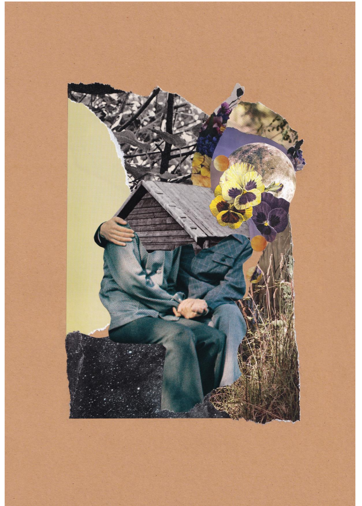
Laura Quevedo Connection, 2022 Mixed Media Collage, 21x29.7 cm Price: 200 USD