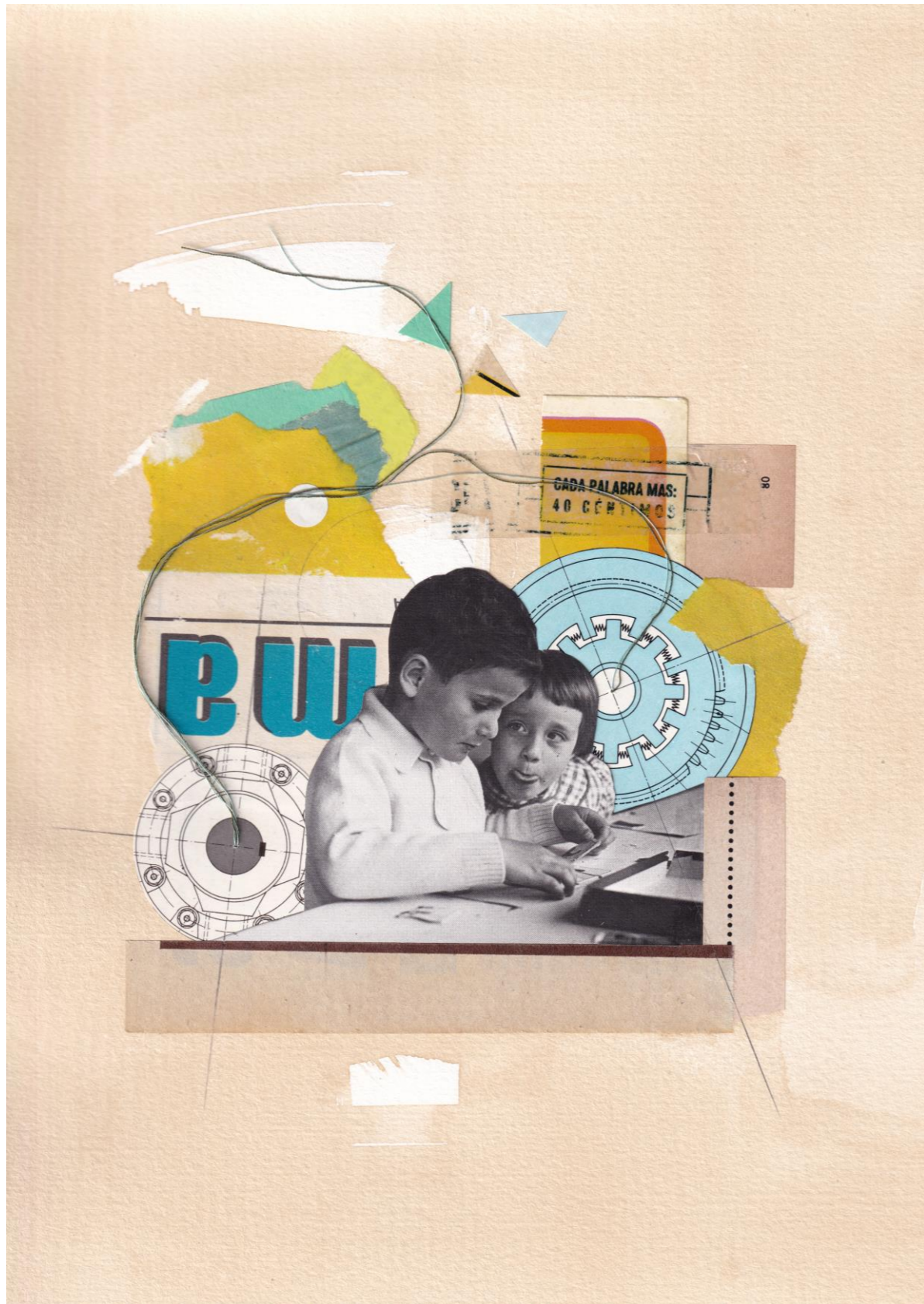
Laura Quevedo Games, 2022 Mixed Media Collage, 21x29.7 cm Price: 200 USD