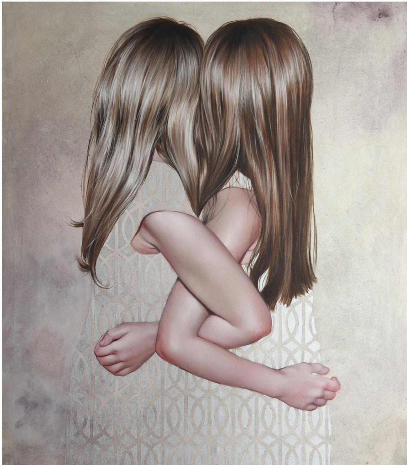
Antonella Cinelli Difficult resemblances #1, 2022 Oil and aluminum powder on canvas, 80x70 cm Price: 4000USD