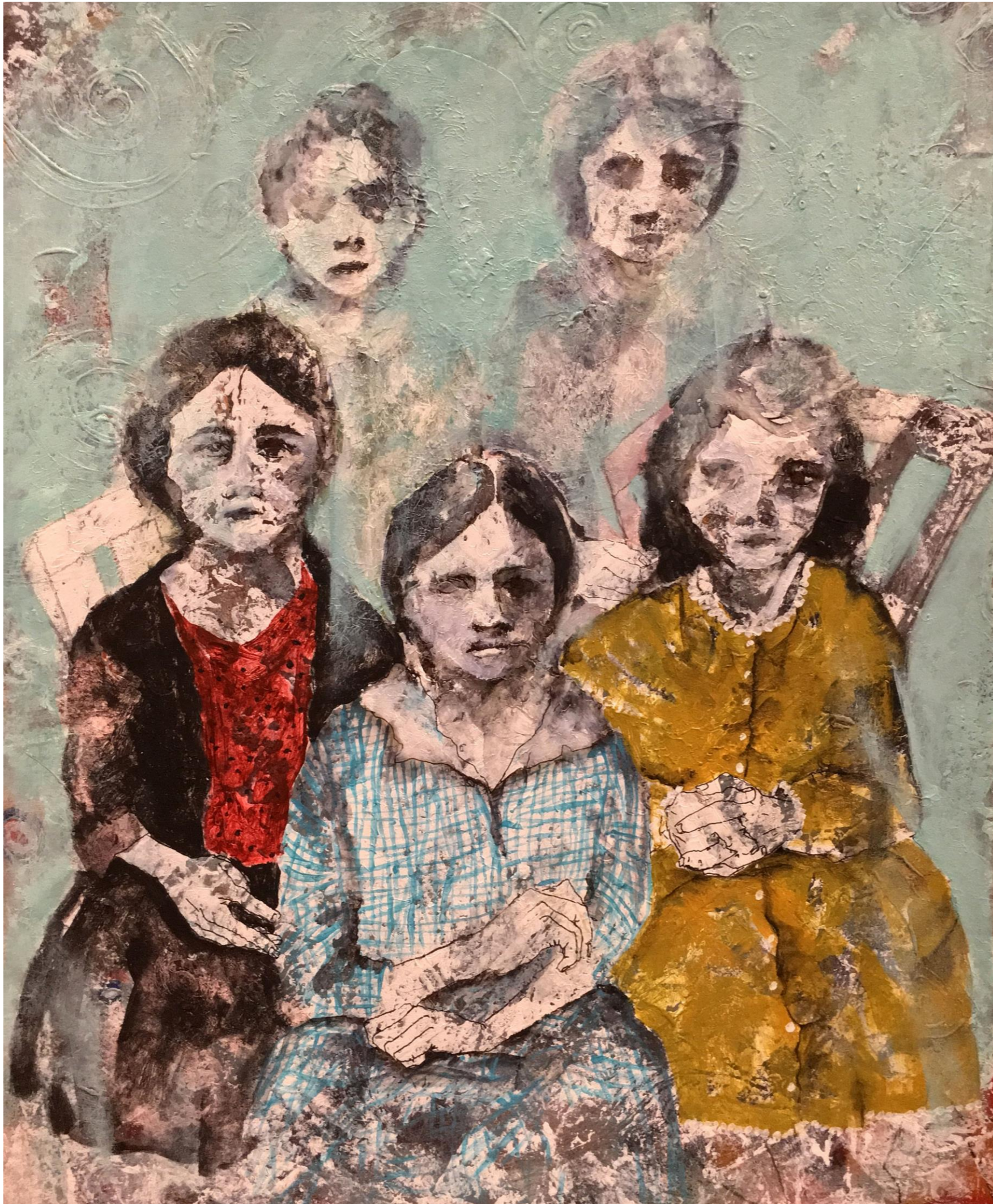
We Are Dead And Death Doesn't Understand Acrylic on cardboard, 30 x 20 cm, 2019