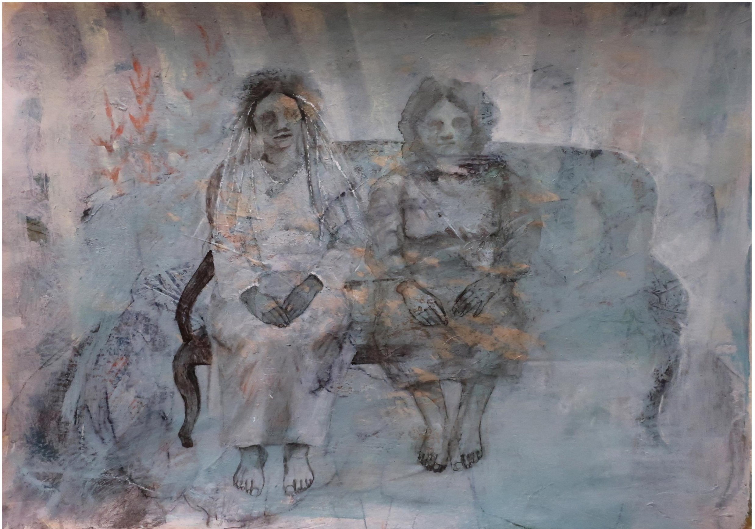
We Are Dead And Death Doesn't Understand Acrylic on cardboard, 20x30 cm, 2020