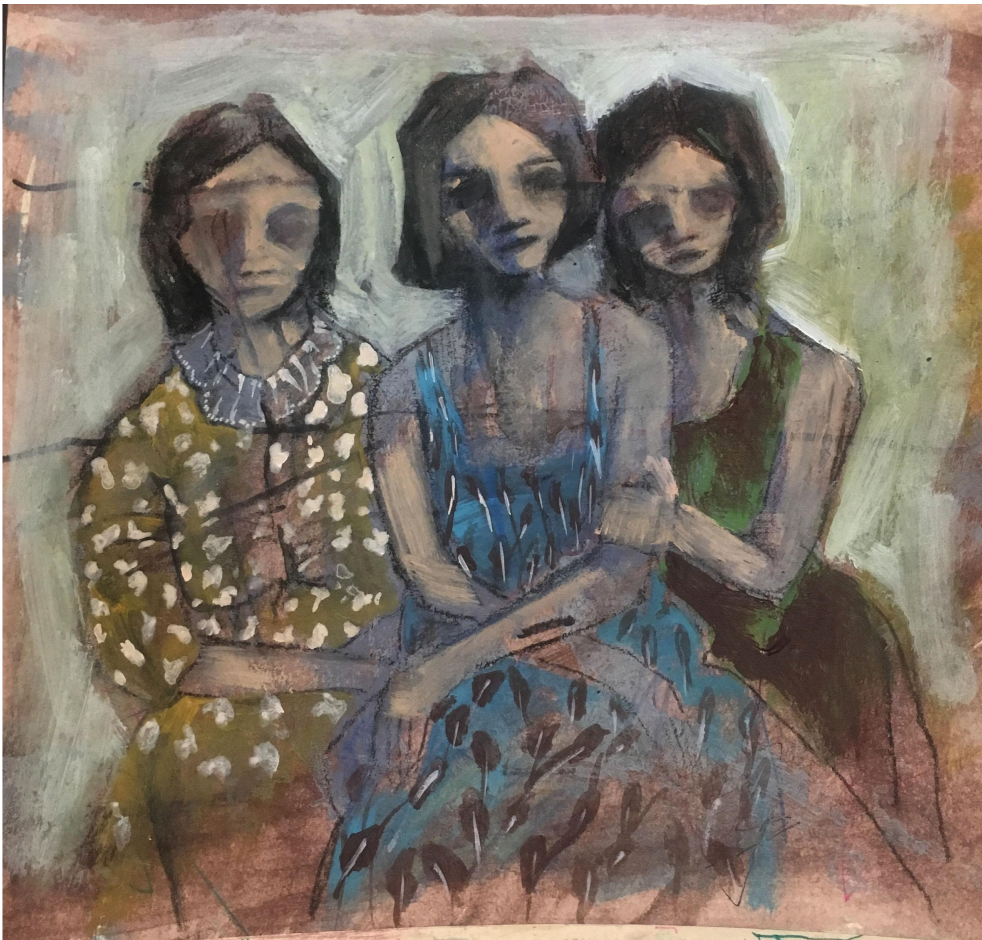
We Are Dead And Death Doesn't Understand Acrylic on cardboard, 20x20 cm, 2020