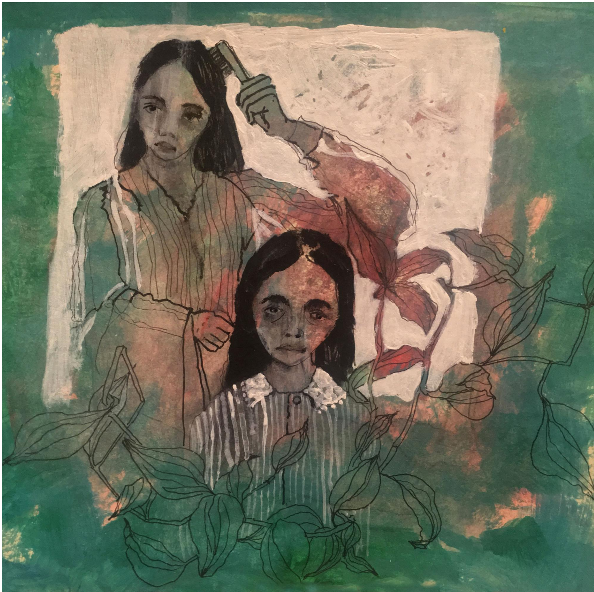
We Are Dead And Death Doesn't Understand Acrylic on cardboard, 20x20 cm, 2020