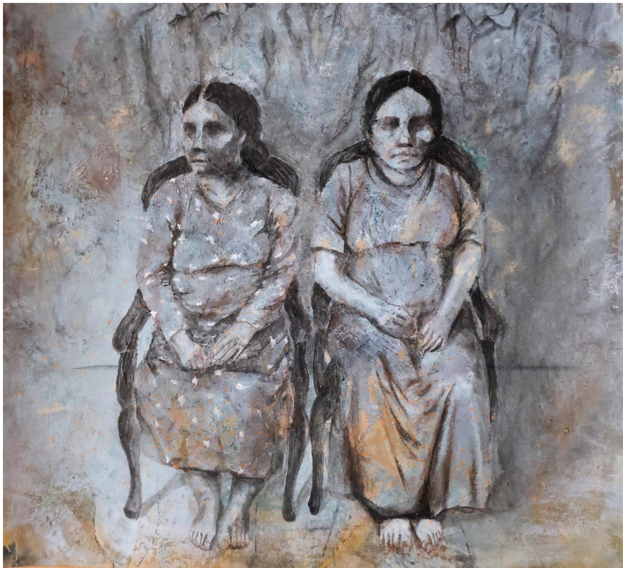
We Are Dead And Death Doesn't Understand Acrylic on cardboard, 20x22 cm, 2021