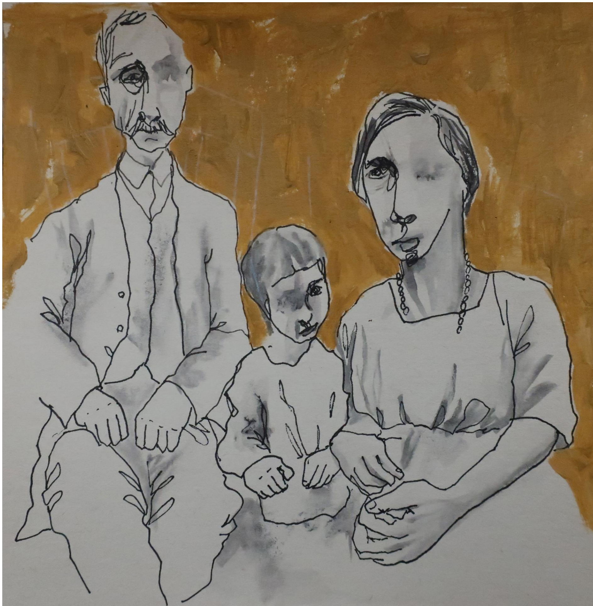
We Are Dead And Death Doesn't Understand Acrylic on cardboard, 20x20 cm, 2019