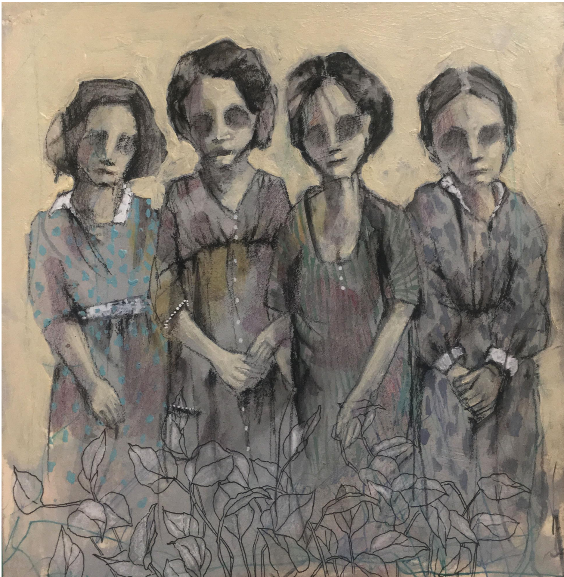
We Are Dead And Death Doesn't Understand