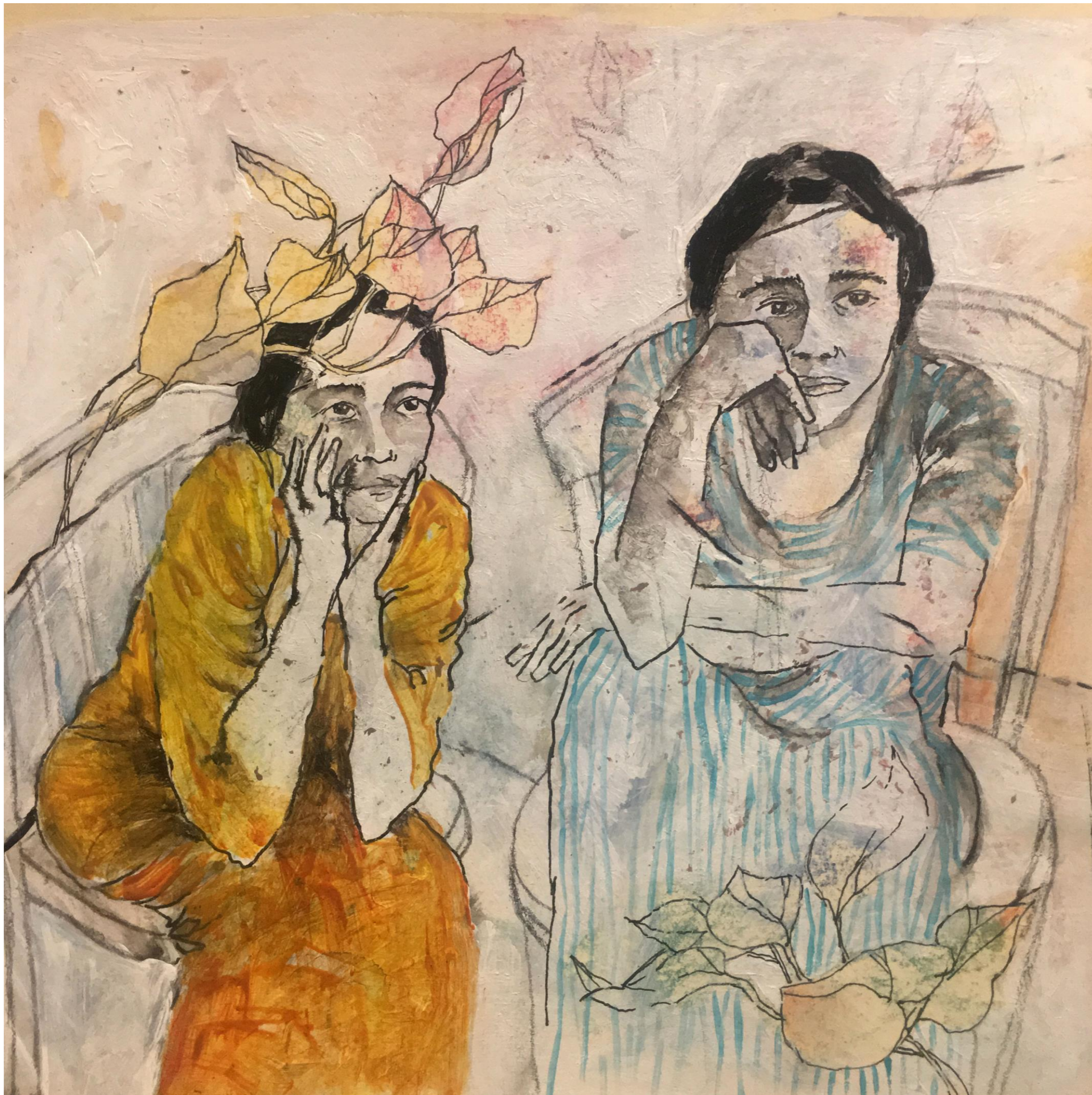
We Are Dead And Death Doesn't Understand Acrylic on cardboard, 20x20 cm, 2019