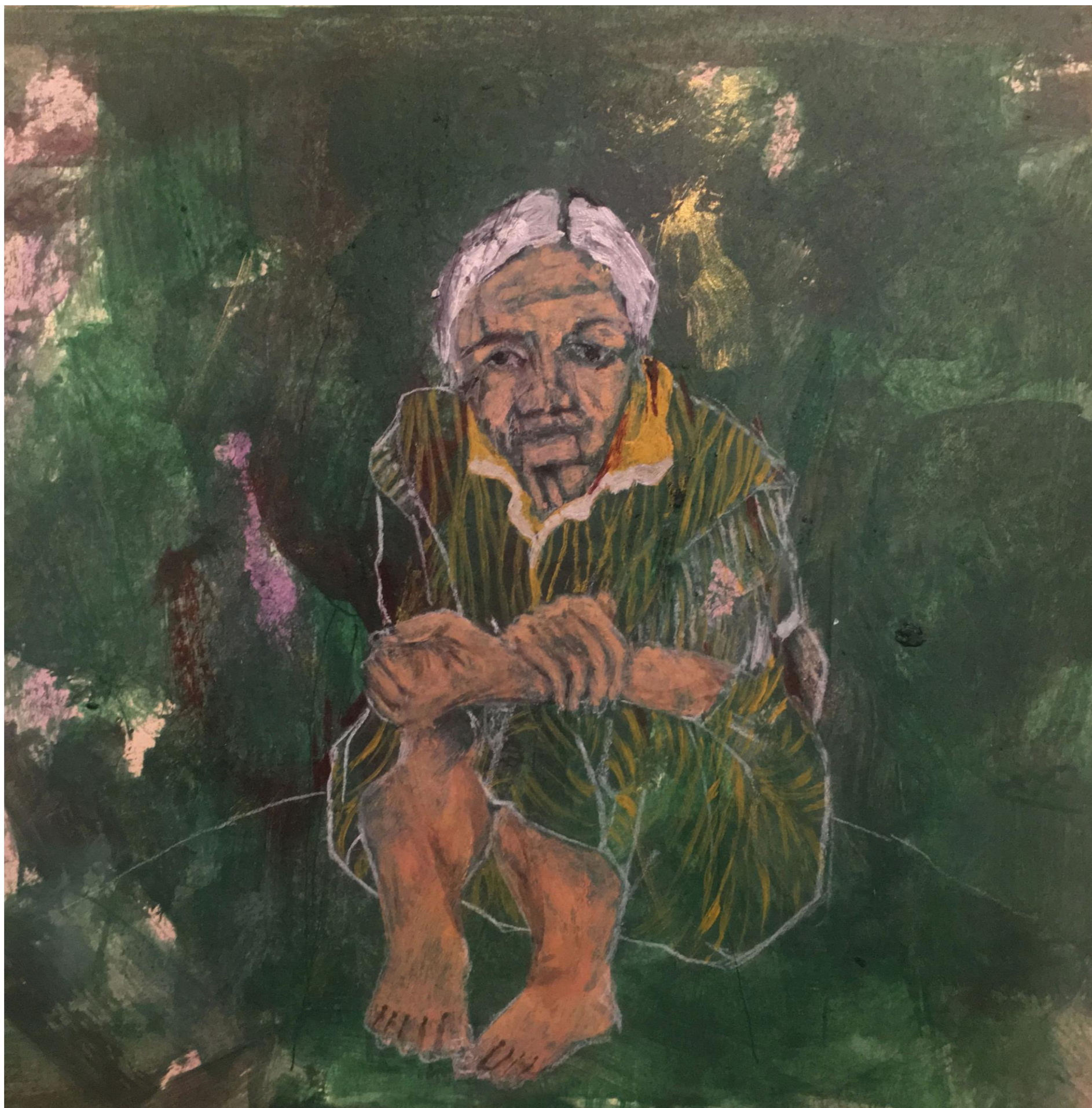
We Are Dead And Death Doesn't Understand