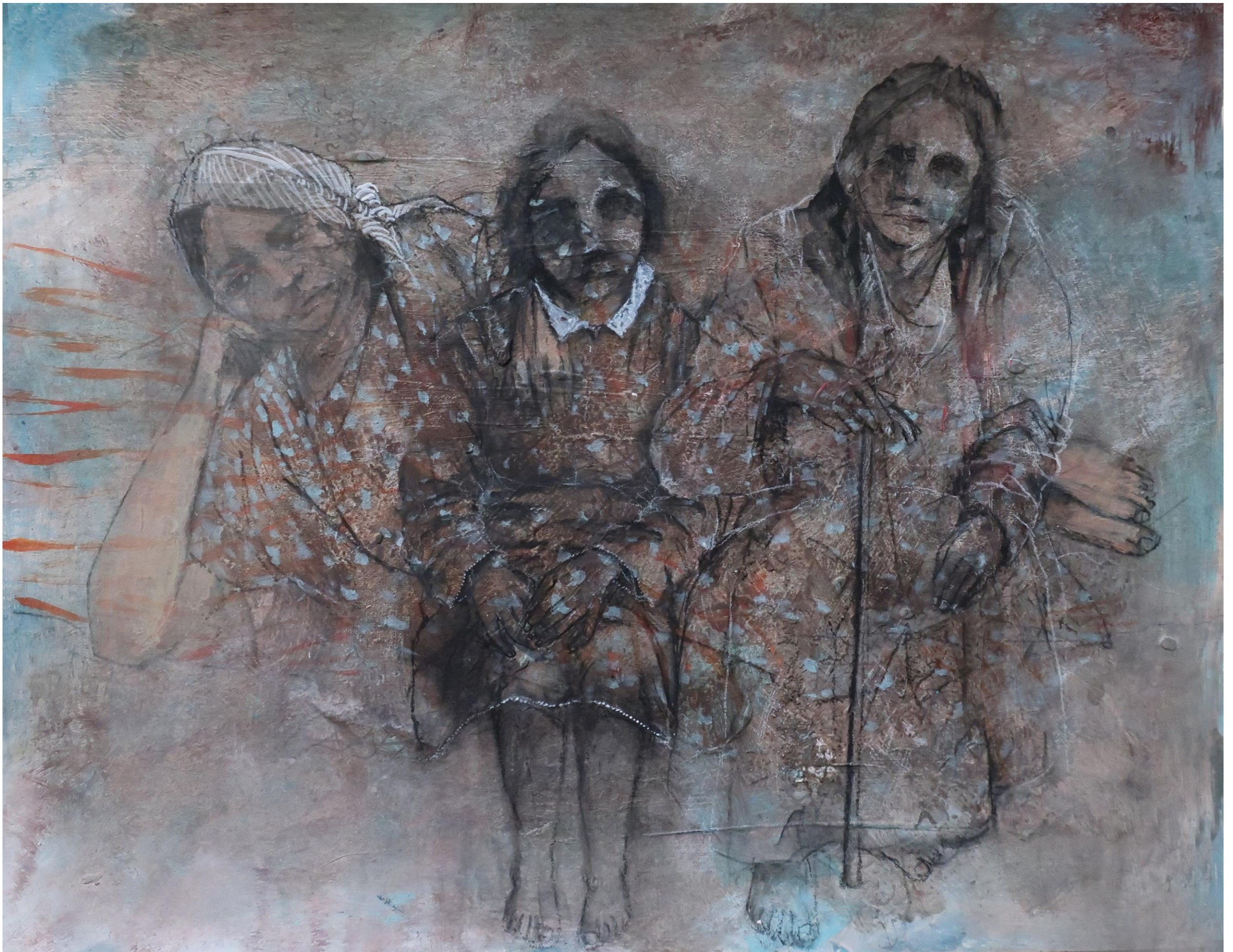
We Are Dead And Death Doesn't Understand Acrylic on cardboard, 20x30 cm, 2020