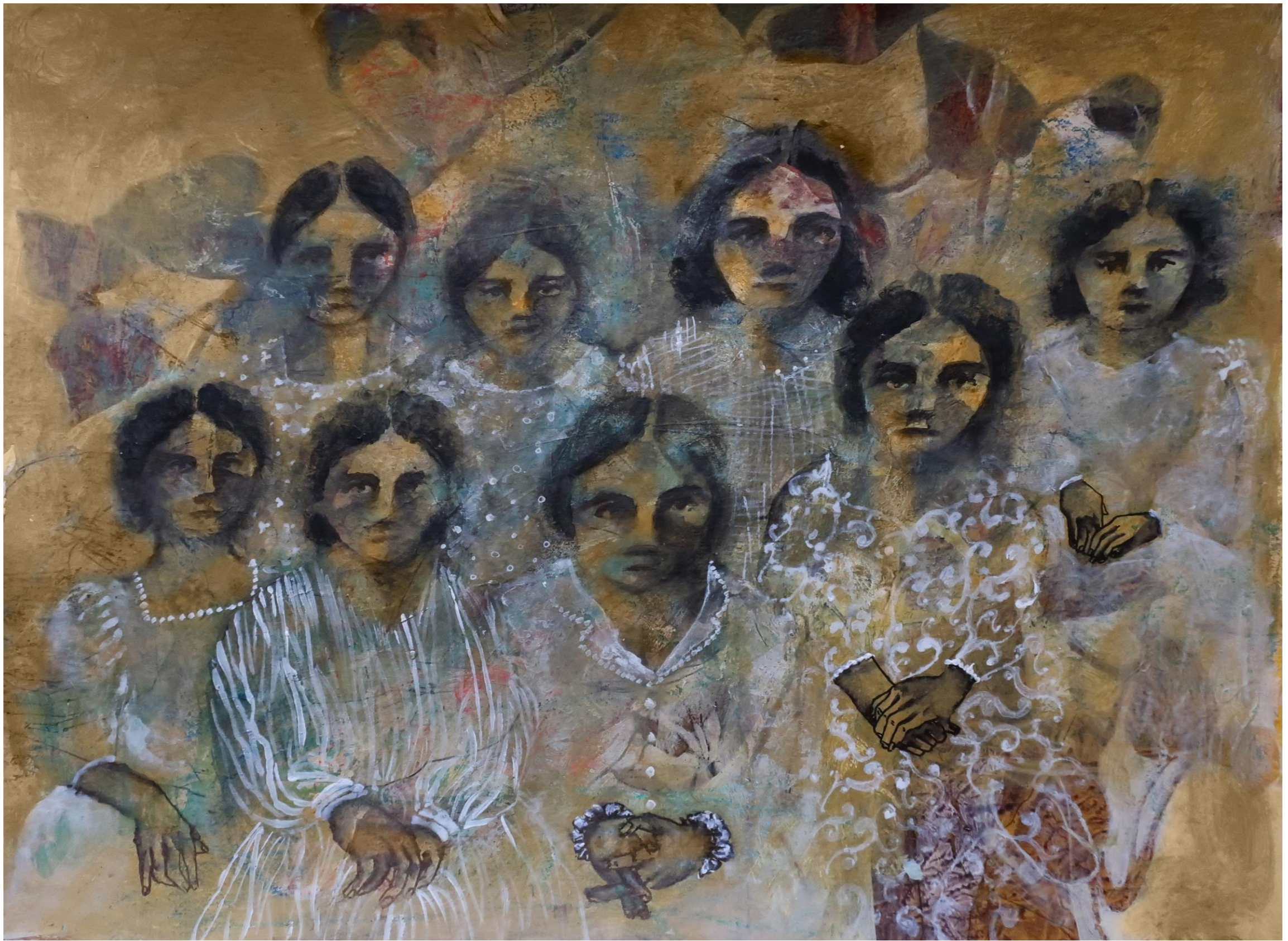
We Are Dead And Death Doesn't Understand Acrylic on cardboard, 20x30 cm, 2020