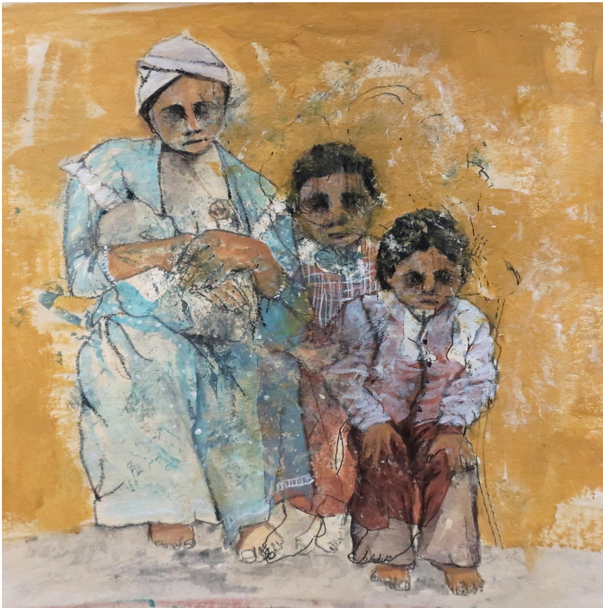
We Are Dead And Death Doesn't Understand Acrylic on cardboard, 20x20 cm, 2021