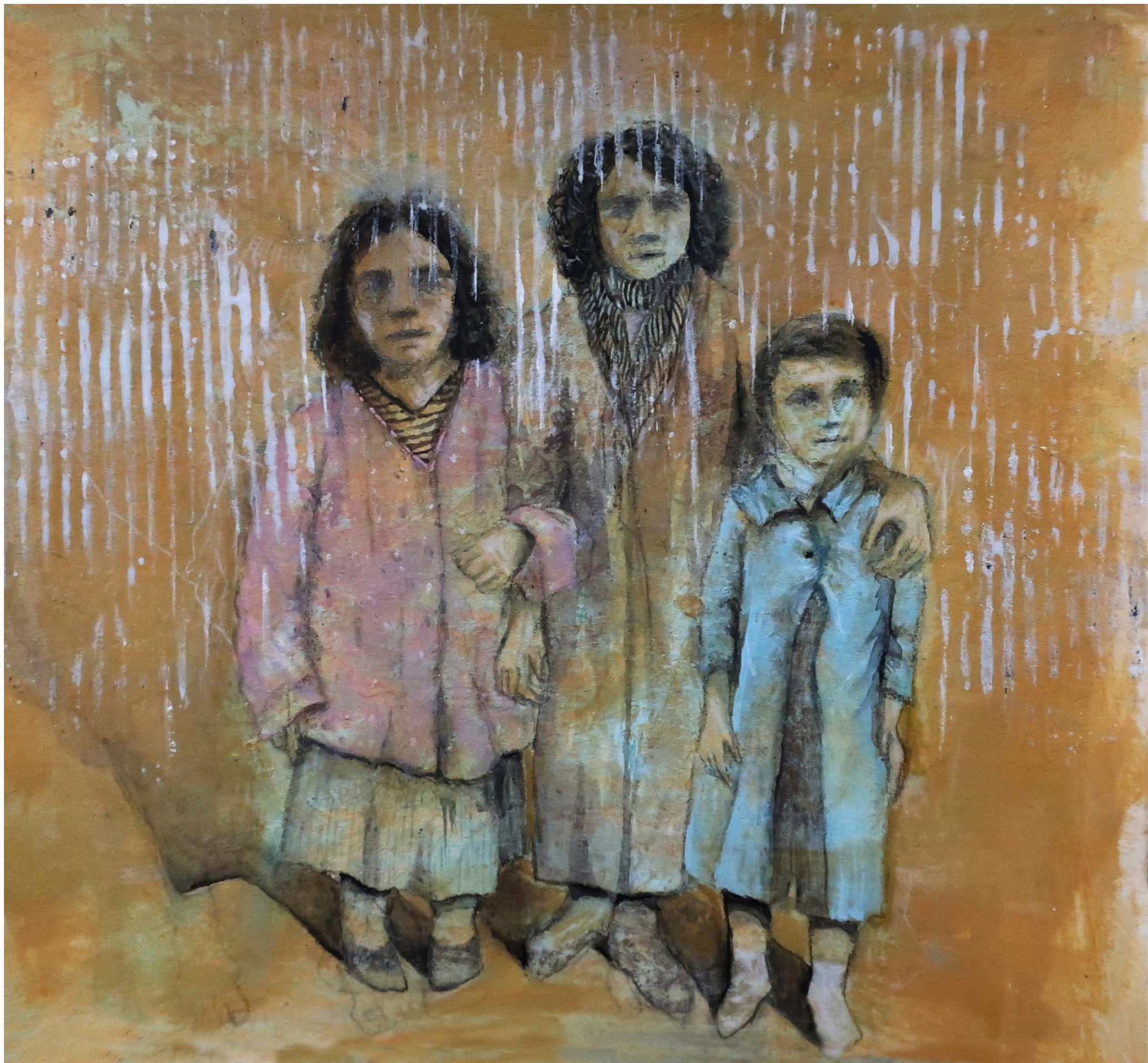
We Are Dead And Death Doesn't Understand