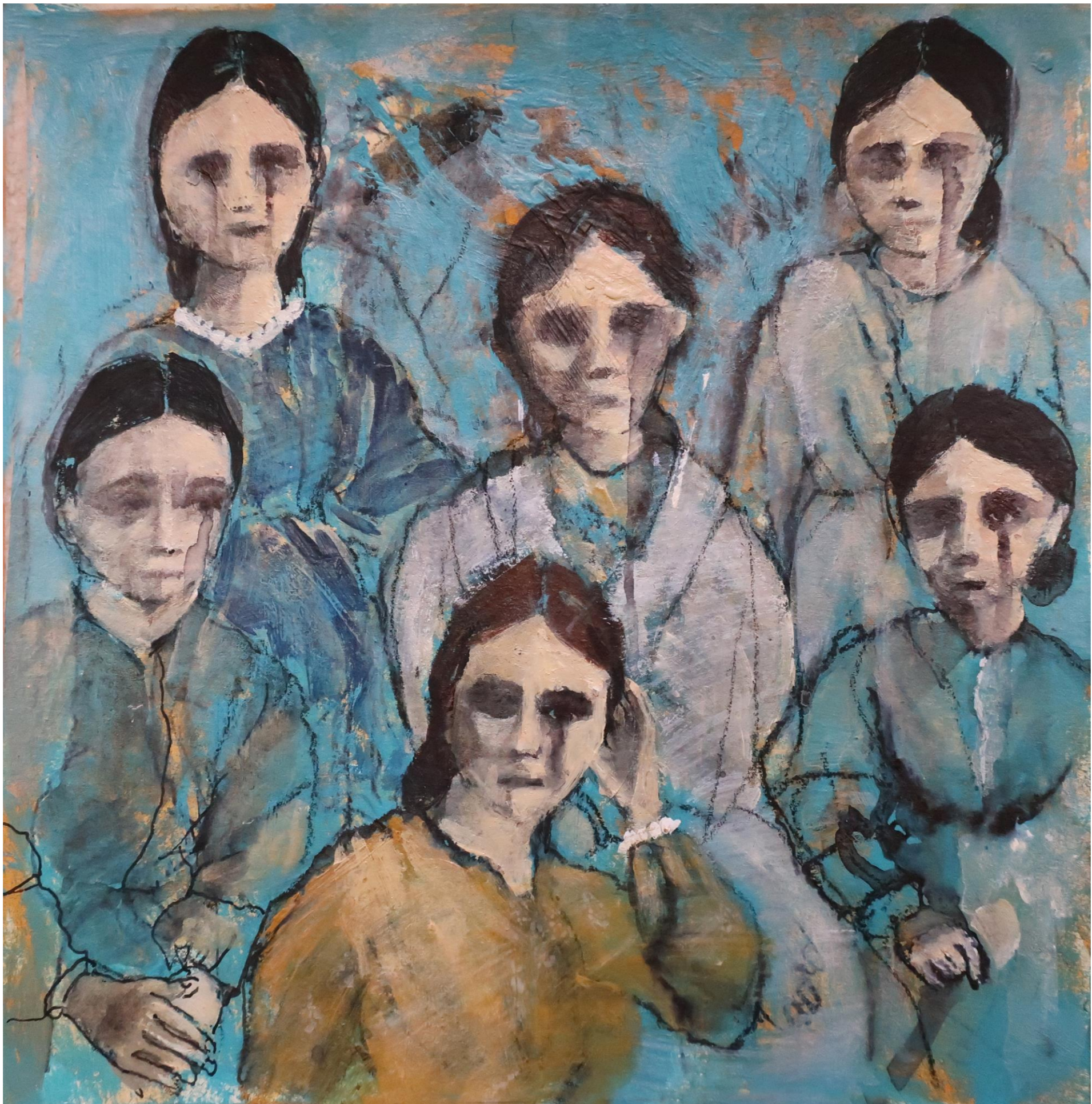
We Are Dead And Death Doesn't Understand Acrylic on cardboard, 20x20 cm, 2019