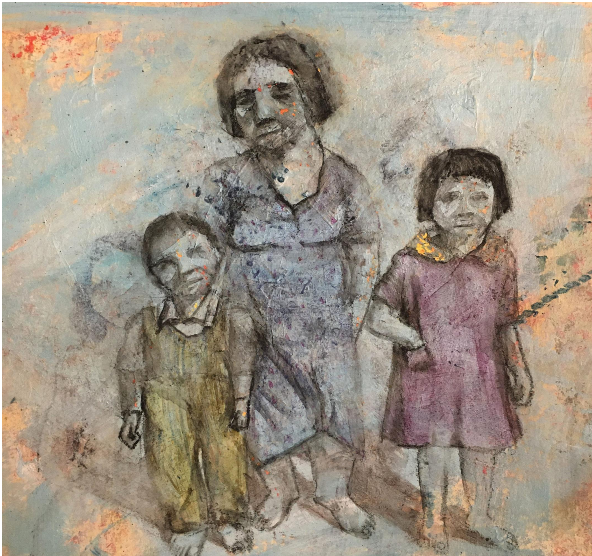
We Are Dead And Death Doesn't Understand