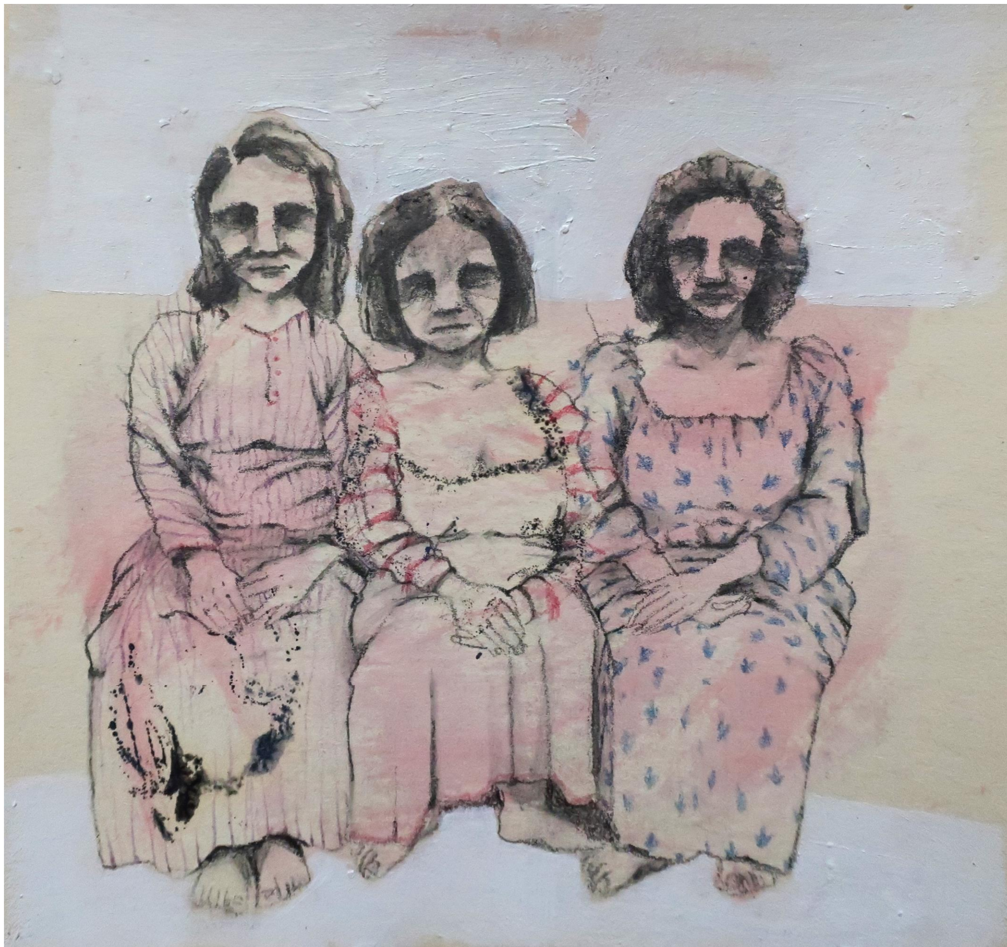
We Are Dead And Death Doesn't Understand