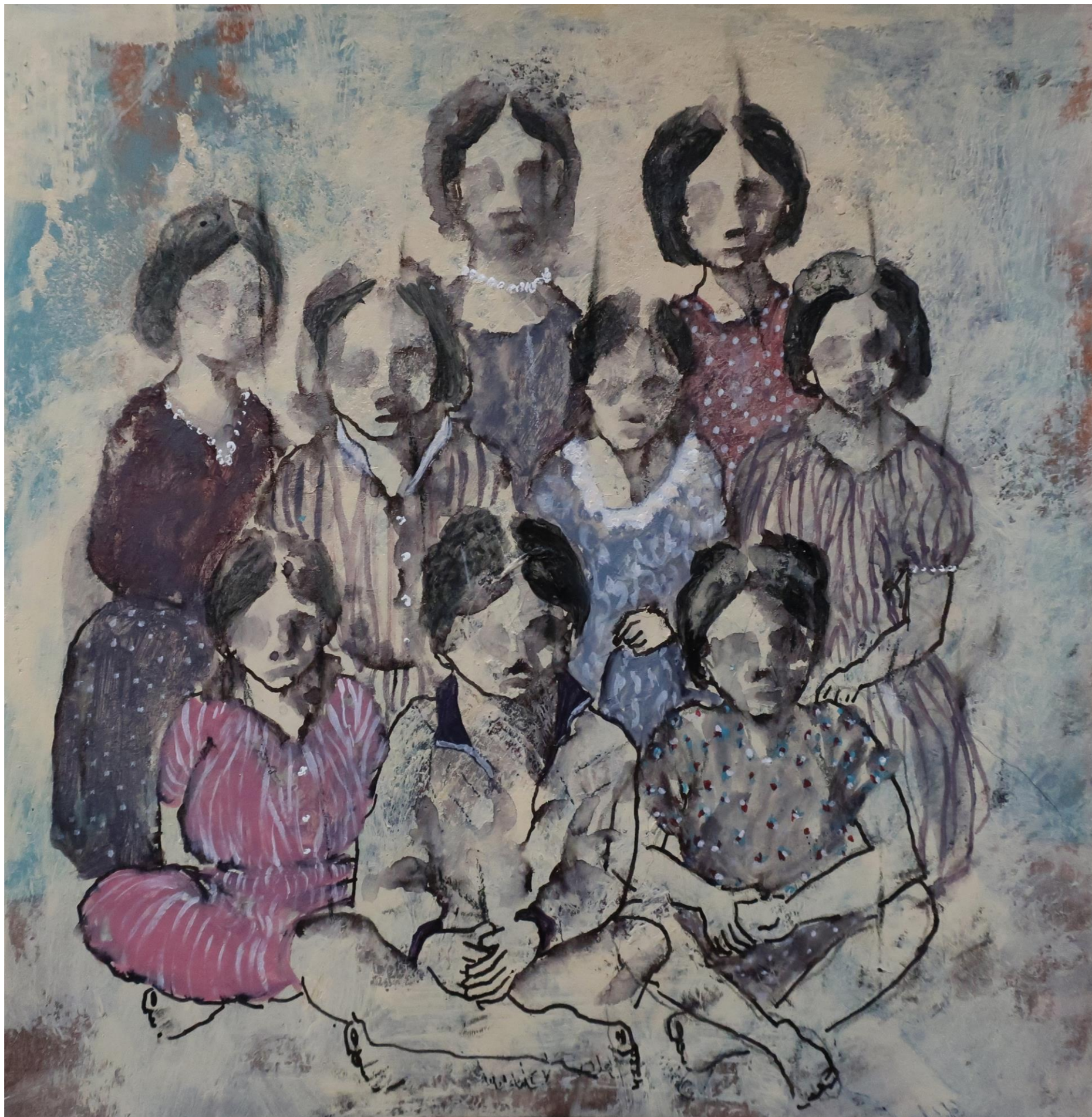
We Are Dead And Death Doesn't Understand Acrylic on cardboard, 20x20 cm, 2020