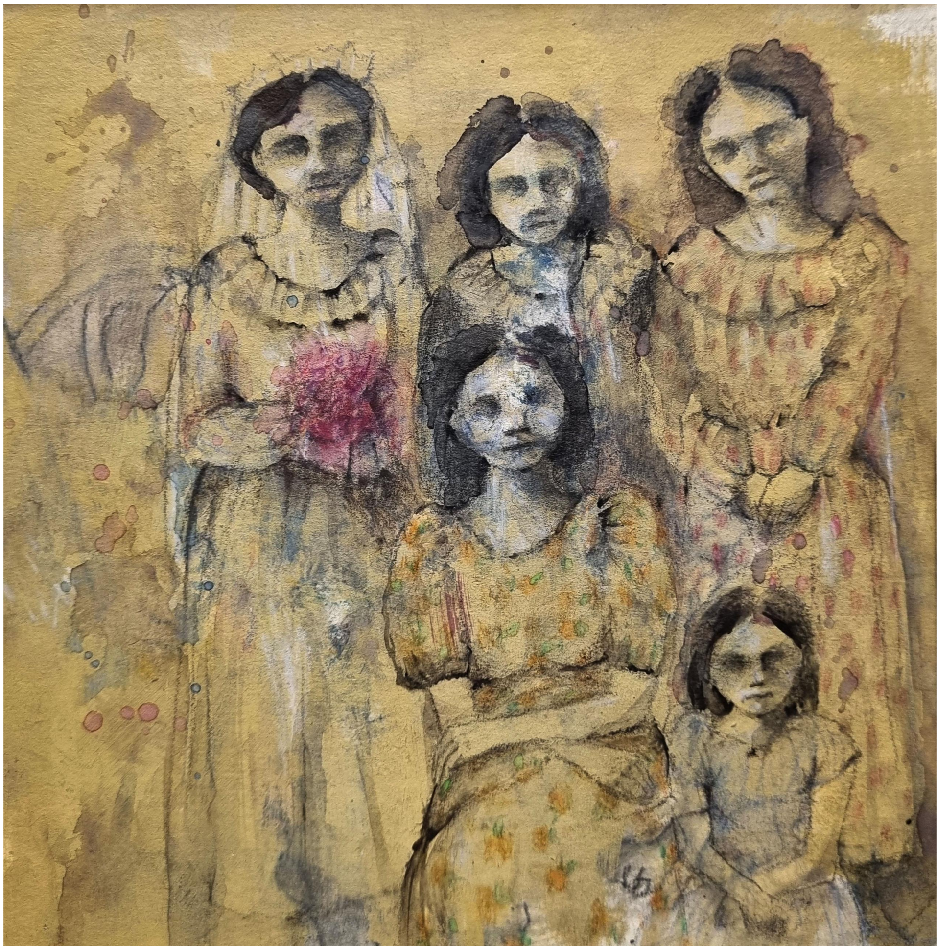
We Are Dead And Death Doesn't Understand