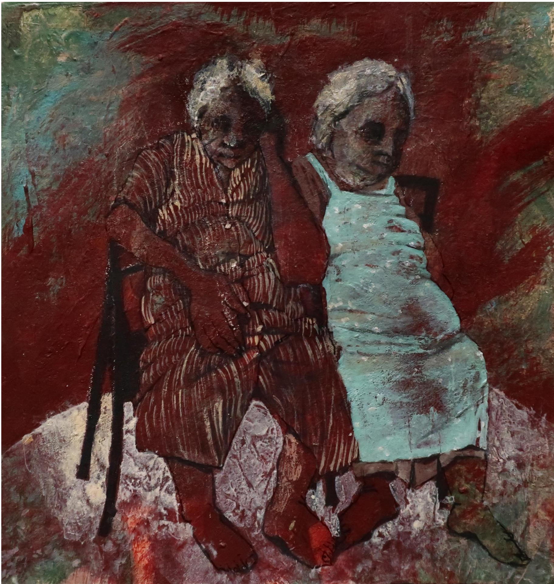
We Are Dead And Death Doesn't Understand Acrylic on cardboard, 20x20 cm, 2020