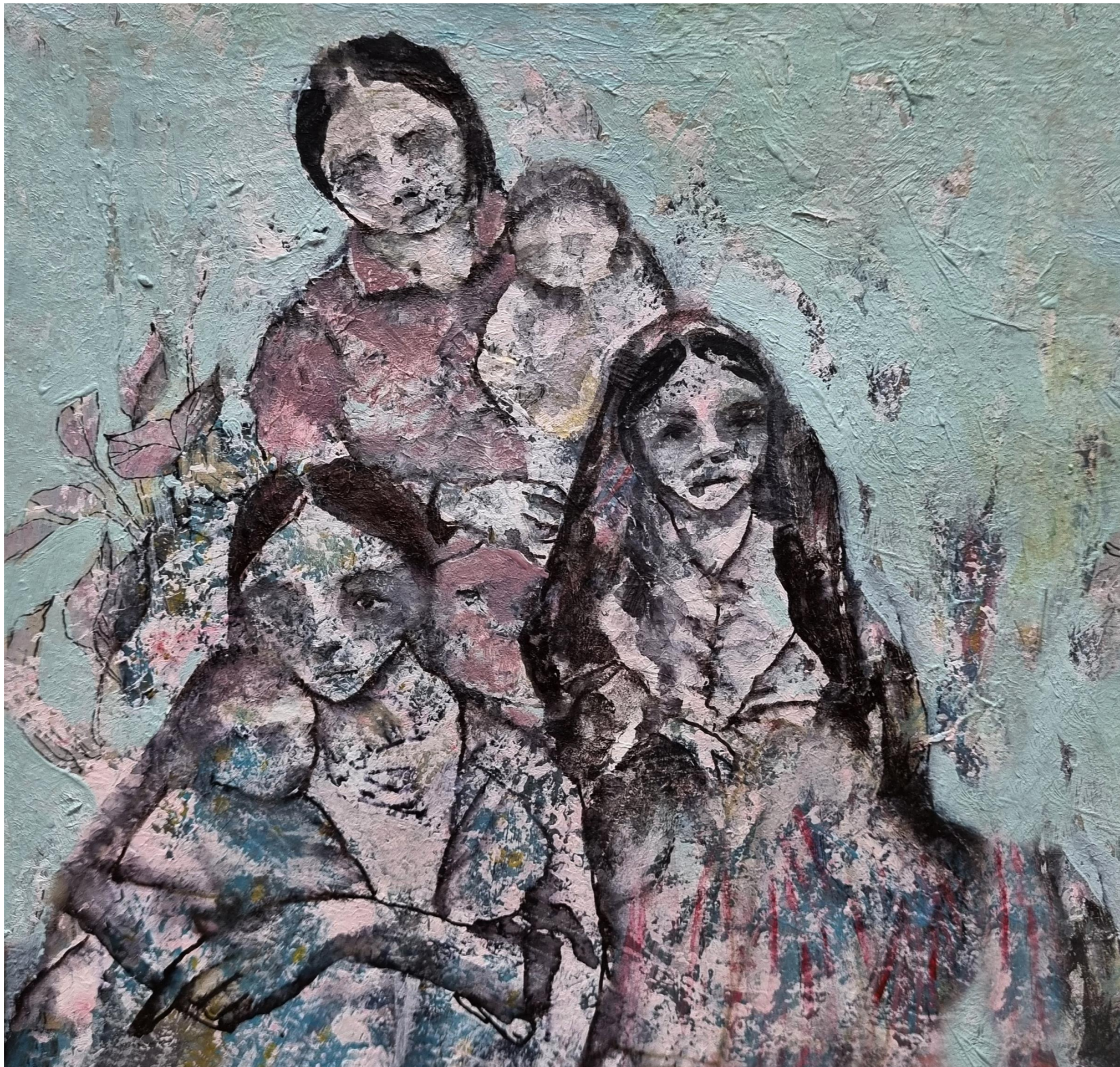
We Are Dead And Death Doesn't Understand