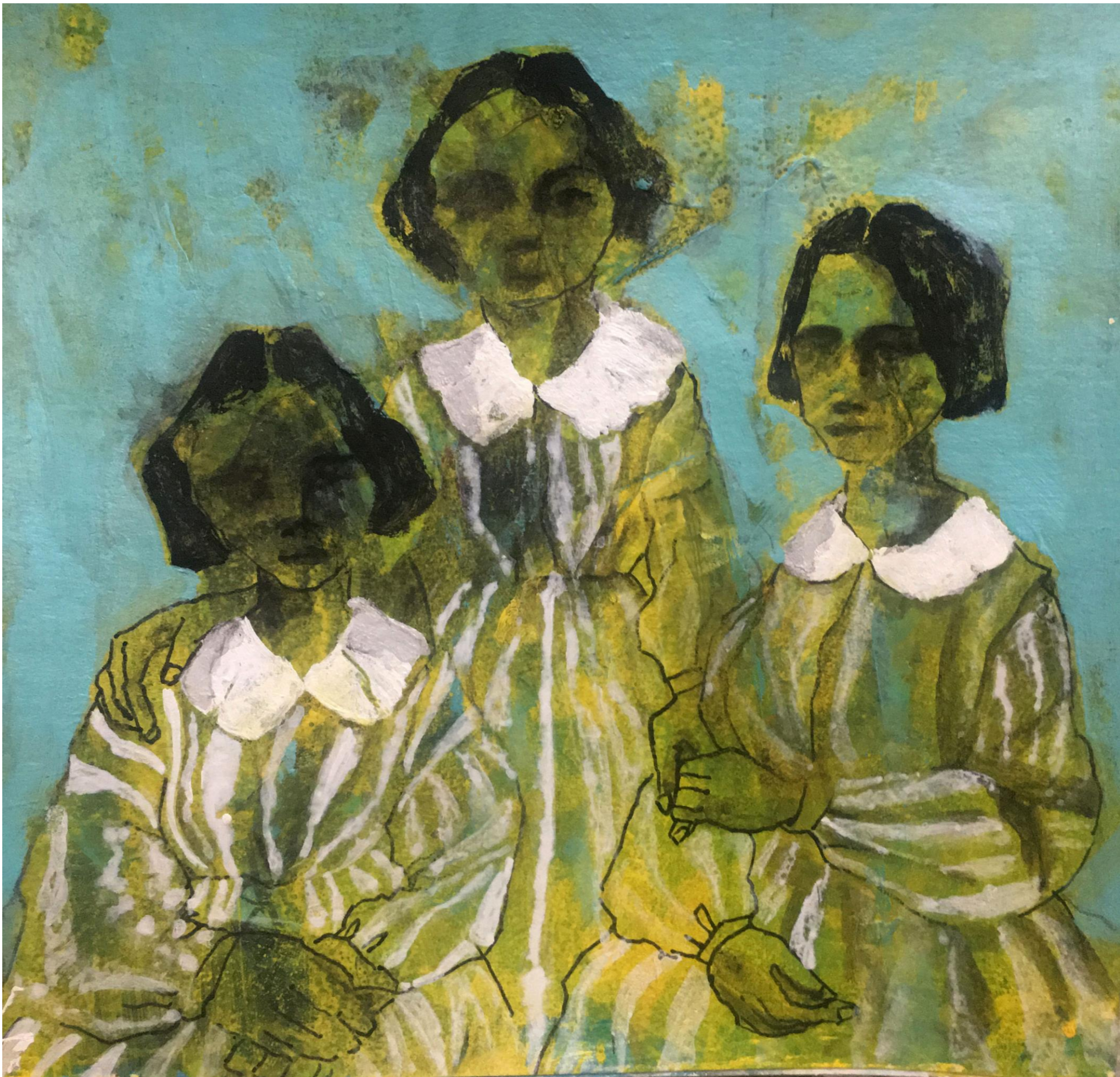
We Are Dead And Death Doesn't Understand