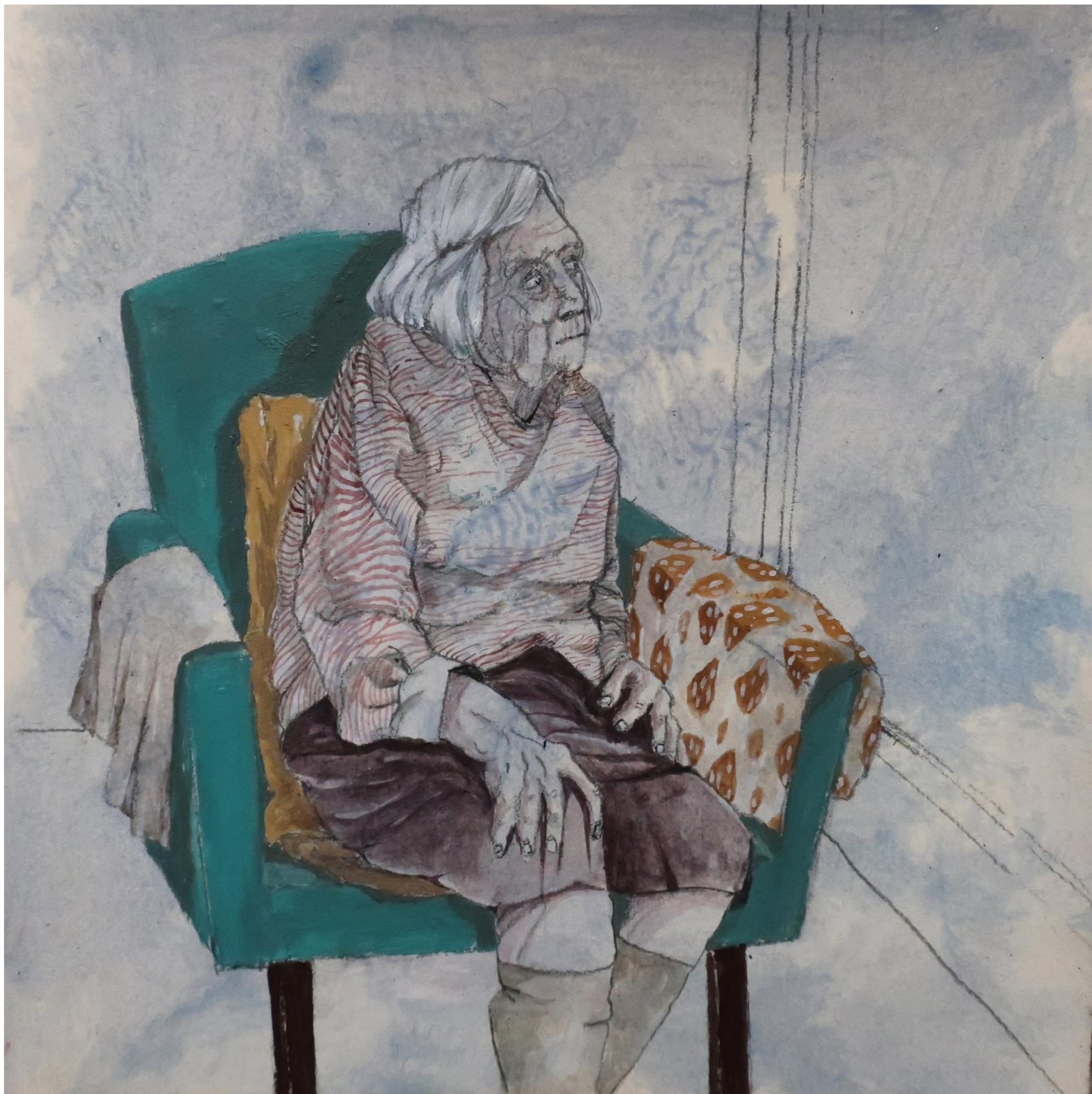
We Are Dead And Death Doesn't Understand