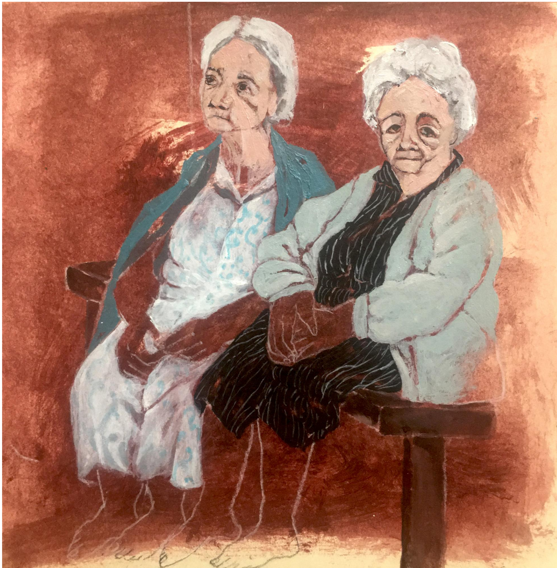
We Are Dead And Death Doesn't Understand