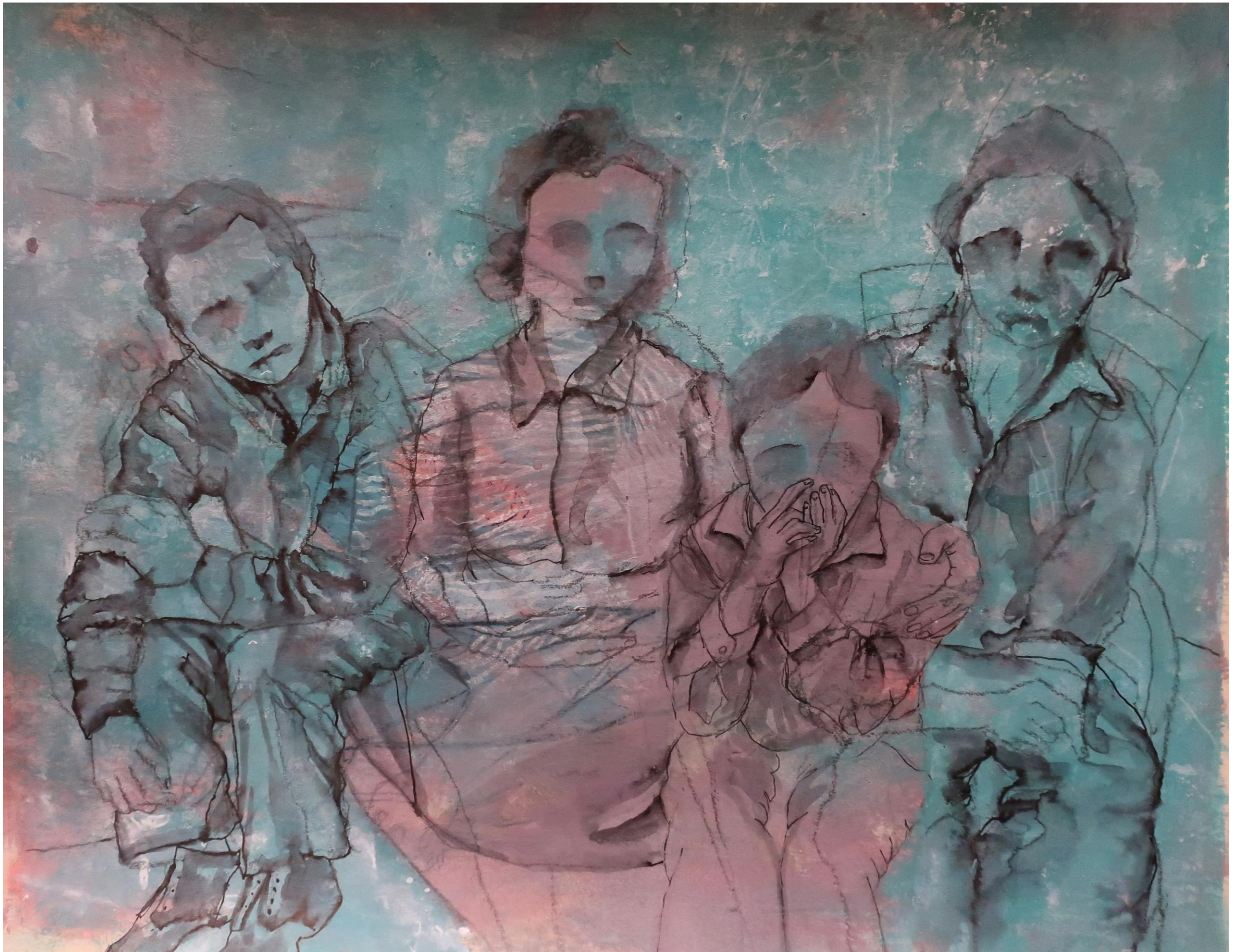
We Are Dead And Death Doesn't Understand Acrylic on cardboard, 20x30 cm, 2020